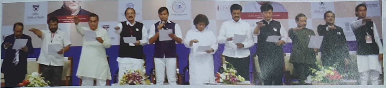
M. Venkaiah Naidu and Zakir Hussain Administering Oath of "Swachh Bharat", "Start up Nation", "Make In India", at 6 th BCS