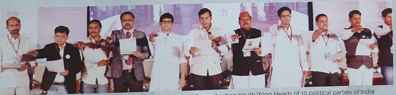
History was created on the platform of 3 rd Bharatiya Chhatra Sansad, when Youth Wing Heads of 10 political parties of India came together to appeal to the assembled student leaders to join the political process of the country for nation building and to strengthen the democratic fabric of our nation.