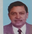
N. Santosh Hegde Former Justice, Supreme Court of India Former Lokayukta, Karnataka