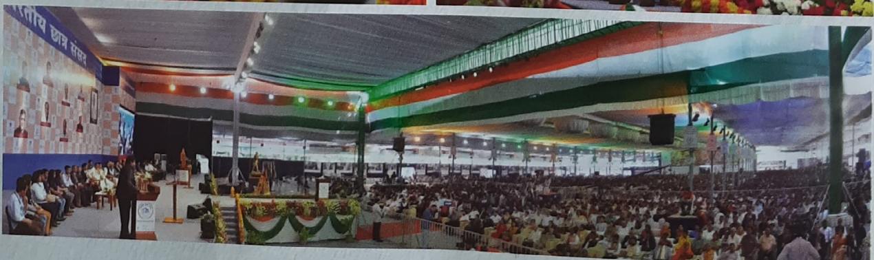
The sequence of above photographs is randomly arranged.