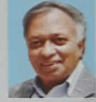
Vijay Bhatkar Chancellor, Nalanda University Eminent Computer Scientist