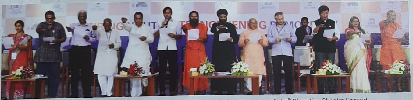
Yog Guruswami Ramdev Administering Oath of "Strengthening Democracy" at 7 th Bharatiya Chhatra Sansad