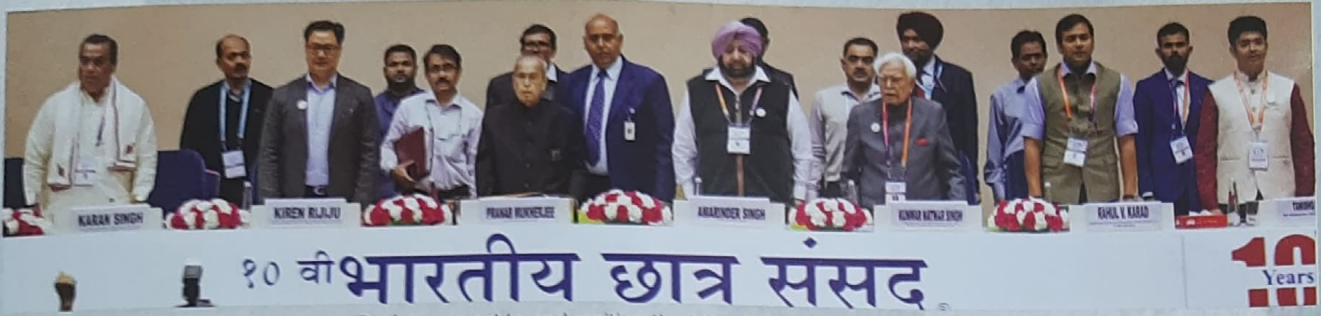
Paying respect to and reciting the National Anthem, at 10 th BCS